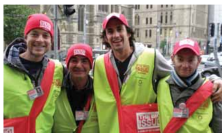
Hamish Blake & Andy Lee with vendors

The OMA has proudly sponsored The Big Issue for the past two years, providing more than $2 million in advertising space to raise awareness of both the magazine and Homeless World Soccer Cup held in Melbourne's Federation Square in late 2008.