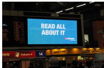
Above: Digital screen at London's Victoria Station.

In the US, protocols have been developed with State emergency