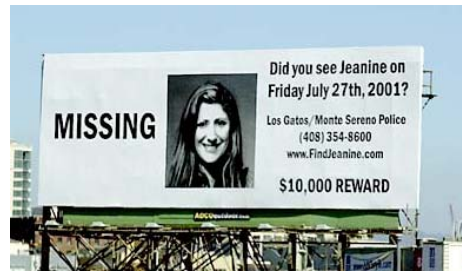
Above: Missing persons billboard in the United States

The OMA is hopeful of progressing our crime-fighting trial over the coming months.